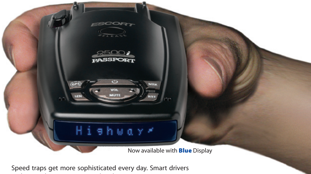
Now available with Blue Display

Limited Time Offer Trade-in your old detector and save!